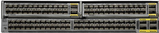
Figure 3. Cisco Nexus 56128P Port View (Rear)

The Cisco Nexus 56128P (figure 4) also offers two slots for a Generic Expansion Modules (GEM). The GEM for the Cisco Nexus 56128P provides 24 ports 10G Ethernet/FCoE or 2/4/8G Fibre Channel and 2 ports 40 Gigabit QSFP+ Ethernet/FCoE ports. The expansion module supports native 40 Gigabit Ethernet on the QSFP+ ports. The expansion module is supported on the Cisco Nexus 56128P chassis only and can be populated in either of the two expansion slots.