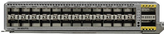
Figure 4. Cisco Nexus 56128P Generic Expansion Module (GEM)

The Cisco Nexus 56128P platform is constructed with the components shown in Figure 5 below. The Cisco Nexus 56128P has four N+1 redundant, hot-swappable powersupplies and four N+1 redundant, hot-swappable independent fans. The Cisco Nexus 56128P supports both Front-to-rear and reversible airflow options