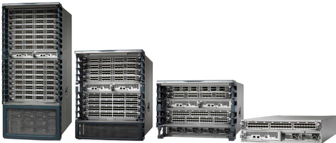
Figure 1. Cisco Nexus 7700 Switches

The Cisco Nexus 7700 switches (Figure 1) have operational and feature consistency with the existing Cisco Nexus 7000 Series Switches, using common system architecture, the same application-specific integrated circuit (ASIC) technology, and the same proven Cisco NX-OS Software releases.