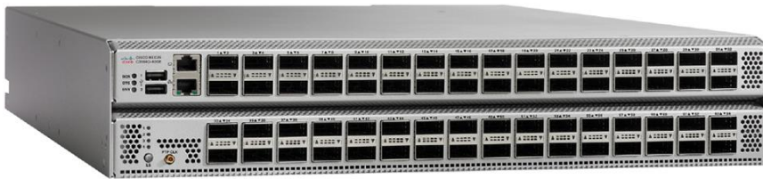
Figure 1. Cisco Nexus 3164Q Switch

The Cisco Nexus 3164Q (Figure 1) is a 40-Gbps Quad Small Form-Factor Pluggable (QSFP)-based switch with 64 Enhanced QSFP (QSFP+) ports. Each QSFP+ port can operate in native 40-Gbps or 4 x 10-Gbps mode, up to a maximum of 256 10G ports.